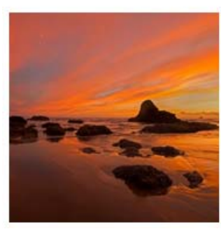
Exploring Oregon Tuesday 1st – Wednesday 16th November 2016 Tour Cost: £2,100 (Plus flights)

The Pacific State of Oregon is often overlooked for the better known and apparently more glamorous locations when people consider a visit to the USA. Yet Oregon offers some of the finest photography to be found in North America and numbers amongst its attractions some exciting photographic locations. Our tour in 2016 will centre on the State of Oregon with a brief visit into the redwoods of Northern California. Our tour is planned to coincide with the end of the fall when the Pacific Ocean and the rugged coastline will offer up some potentially exciting and wild conditions.