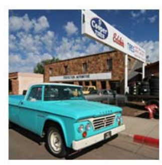
Route 66 Monday 18th April – Saturday 7th May 2016 Tour Cost: £2,395 (Plus flights)

'Get your kicks on Route 66, it flies from Chicago to LA more than 2000 miles all the way' as the opening lyrics of Bobby Troup's famous song go. We are going to get our kicks as we journey the complete route from Downtown Chicago to Santa Monica Pier, more than 2,448 miles enjoying some of the best photography to be found in the United States. Come and join us on our journey of discovery and, for those who remember the 1960's, relive those dreams of driving a red corvette across the vast land that is the United States of America. To drive Route 66 is more than just a journey; it is an opportunity to meet the men and women who made this route so iconic. Many of the legends of this route are still found today, whether it is the Shea Brothers in Springfield, Illinois or Angel Delgadillo in Seligman, Arizona, they all want to have a chat, pose for a photograph and reminisce about times gone by when '66' was the lifeline of the USA.